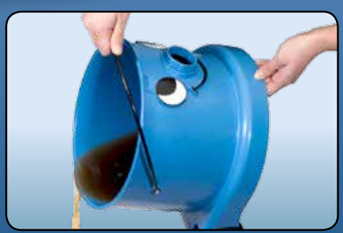
Standard easy emptying handle system