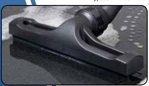
Wet pick-up nozzle