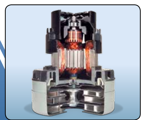
Bypass TwinFlo motor